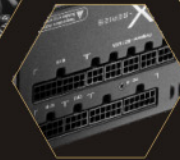
Patented DC connector Module