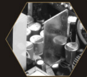
High Quality 105°C Cap